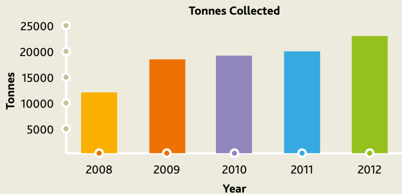
Graph 2: Farm Plastics Waste Collected 2012

IFFPG had an exceptional year for collections in 2012, with a record 23,556 tonnes of material collected for recycling. As can be seen in Graph 2, collections increased by 13% compared to the previous year. Increased collections can be attributed to a number of factors, including operating more bring-centres, reduced collection charges and bad weather.