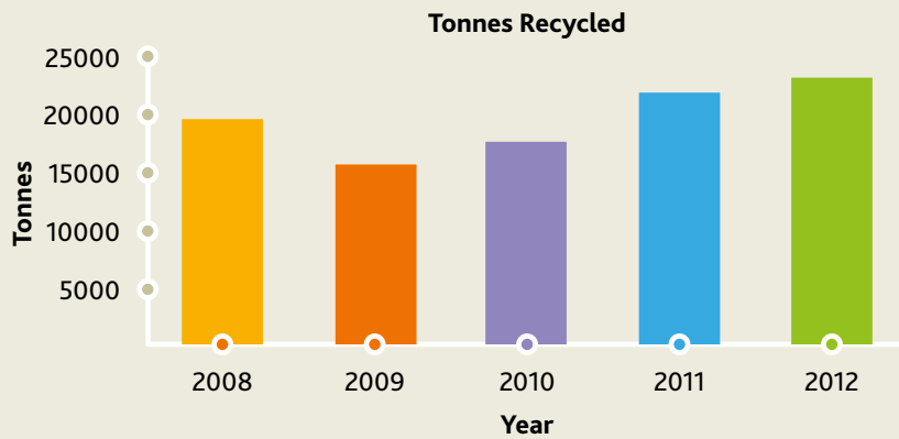
Graph 3: Material Recycled 2012

Material supplied to recycling facilities is recycled into a range of products, including plastic bags, damp proofing and piping products.